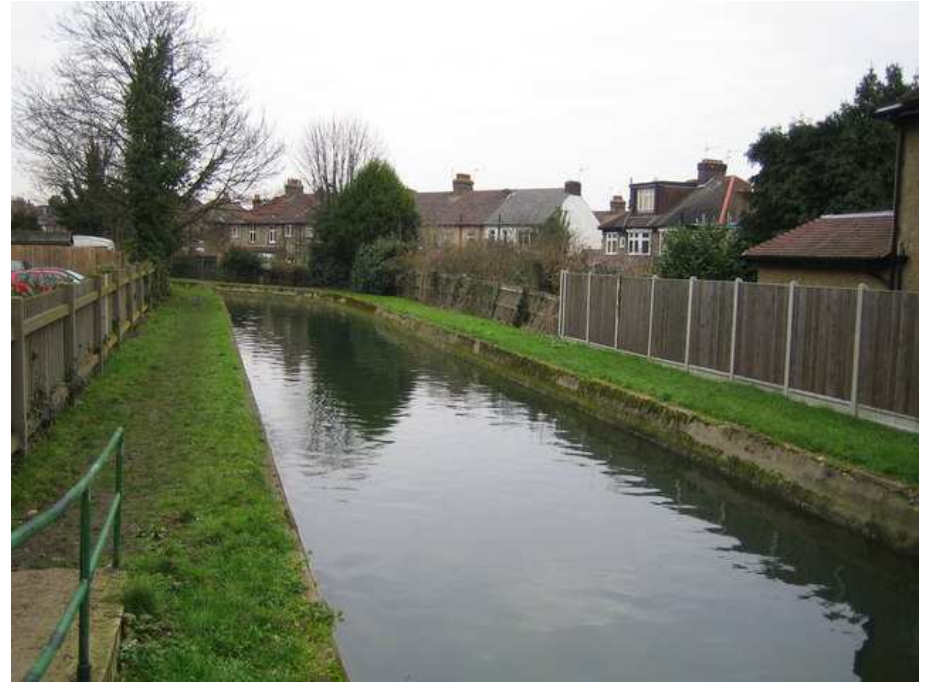
The New River, viewed looking upstream from the Firs Lane road bridge, N21